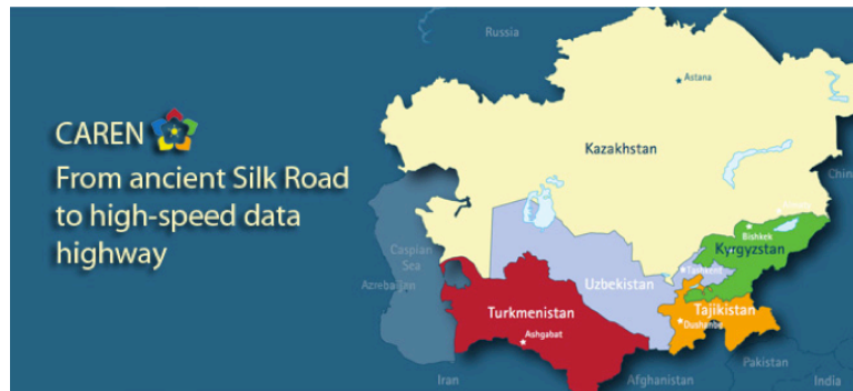
Figure 2 The Central Asian countries that CAREN is serving

Asia. The major part of Central Asian countries' territory is located in the seismically active zone and is prone to hazardous natural processes and phenomena. It requires organizing detailed study of hazardous natural processes and phenomena practically in the whole territory of Central Asian countries. Such kinds of studies are based on the integrated monitoring of the seismic situation, tectonic structures movement, geodynamics of processes and phenomena development, as well as changes of environmental parameters. Without active NRENs such a regional approach to disaster prevention would be impossible. Tele-medicine is another important area for collaboration among Central Asian NRENs due to the shortage of qualified medical doctors and services in rural areas.